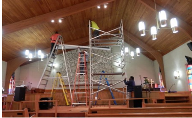
Workers in the Sanctuary

The permits for our Renovation Project have been submitted and are at City Hall. We will know our start date for renovating in several weeks. I know it has been a long process but there is light at the end of the tunnel. When the renovation