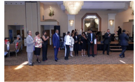
2014 Jazz Luncheon Committee

Stay tuned! We are planning a 4th Annual Jazz Luncheon for Spring